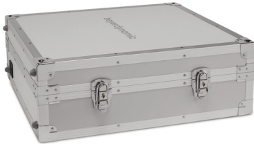
Unite CC closed