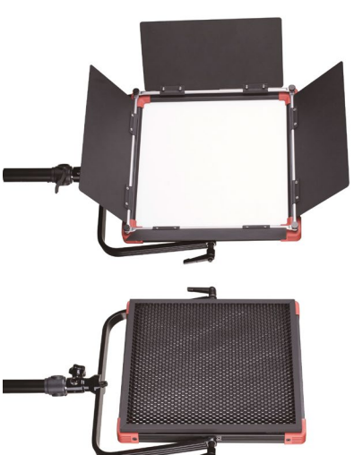
LA-HE60 4-leaf metal barn door