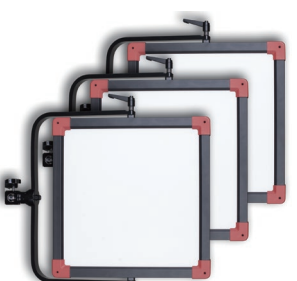
PL-E60 lights x3