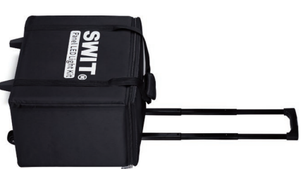
Trolley case x1