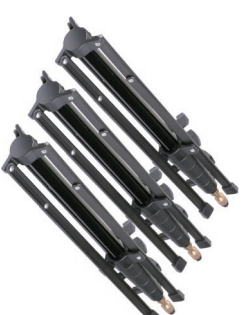
49-200cm tripods x3